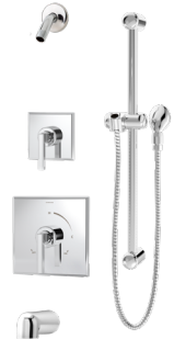
Tub/Shower Trim ADA 3606-H321-V-L/HD-L/HS-TRM SPEC: TUB-TRM27K