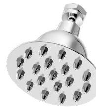
1 Mode Showerhead (1.5 gpm) 4-163-1.5 SPEC: TUB-SHR50SY FOR USE ONLY WHERE 1.5 GPM IS REQUIRED DUE TO WATER CON- SUMPTION RESTRICTIONS. DOES NOT PROVIDE OPTIMAL SHOWER EXPERIENCE.