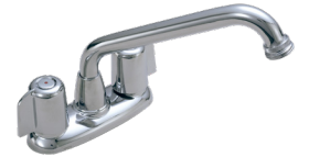
Laundry Sink Faucet S-249 SPEC: SVS-FCT10D