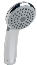
1 Mode Hand Shower (2.5 gpm) ADACHS SPEC: TUB-SHR20M