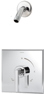
Shower Trim ADA 3601-L/HD-TRM SPEC: SHR-TRM29K