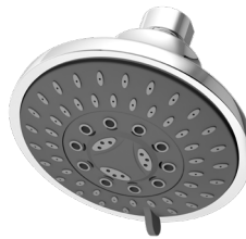
3 Mode Showerhead (2.0 gpm) 552SH-2.0 SPEC: TUB-SHR40M