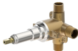
Dual Outlet Diverter Valve Body 2DIVBODYSRT SPEC: SHR-TRM27K