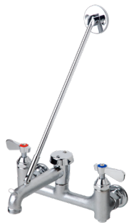
Service Sink Faucet S-2490 SPEC: SVS-FCT09M