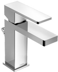
Lavatory Faucet ADA SLS-3612-1.5 SPEC: SNK-FCT28M