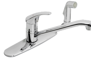
Kitchen Faucet ADA S-23-2-1.5 SPEC: SNK-FCT16A