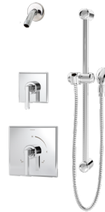
Shower Trim ADA 3605-H321-V-L/HD-L/HS-TRM SPEC: SHR-TRM27K