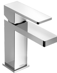
Lavatory Faucet ADA SLS-3612-G-1.5 SPEC: SNK-FCT29M