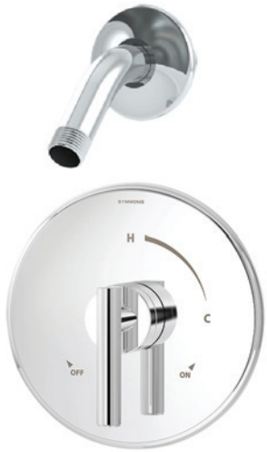
Dia Shower Trim Only 3501-CYL-B-L/HD-TRM Spec No: EXG-101.3