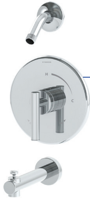
Dia Tub/Shower Trim Only 1103-3502-CYL Spec No: EXG-102.3