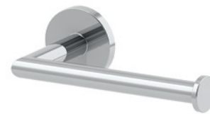
Single Toilet Paper Holder