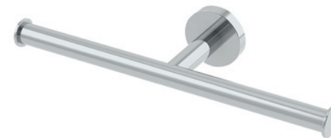
Double Post Toilet Paper Holder