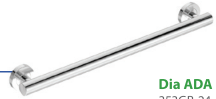
Dia ADA Grab Bar, 24" 353GB-24 Spec No: EXG-165.3