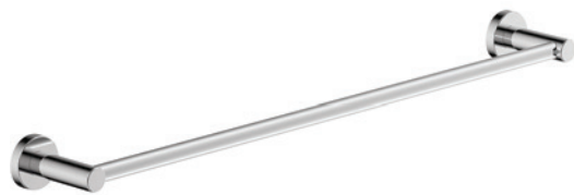
Dia Towel Bar, 24"